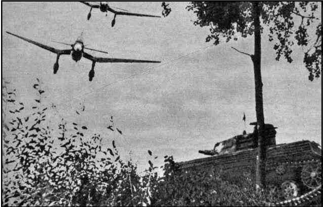
German Invasion of Poland 1 September 1939