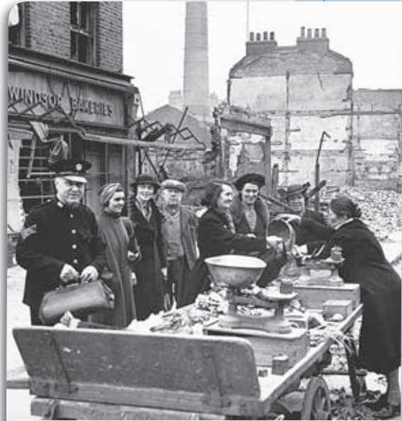
Nazi planes bombed London from September 1940 to May 1941. During that time, residents of London sought shelter wherever they could, including subway stations. Here, a relief effort passes out food to Londoners who have lost their homes.

Churchill was right. In March 1939, German troops seized the rest of Czechoslovakia and began demanding territory from Poland. Great Britain and France pledged to defend Poland if Hitler attacked. To keep the Soviets out of the conflict, Hitler signed a nonaggression pact with Joseph Stalin in August 1939. In