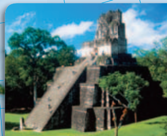
Maya pyramid, Chichén Itzá, Mexico