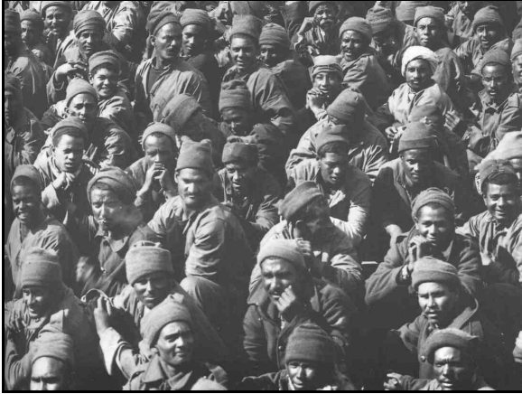
Men from the Egyptian Labor Corps

It was terrible and hard... We were black and we were nothing.