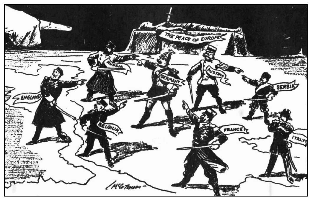
The Crime of the Ages---Who Did It?

This cartoon appeared in the Chicago Tribune after the outbreak of World War I in 1914. Study the cartoon and answer the questions that follow.